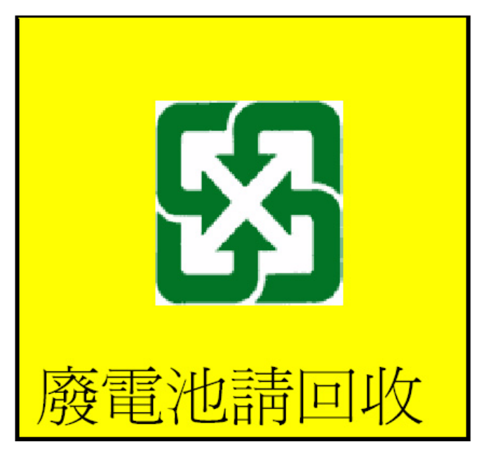
Figure 1-2Taiwan EPA Statement

The Taiwan EPA requires dry battery manufacturing or importing firms in accordance with Article 15 of the Waste Disposal Act to indicate the recovery marks on the batteries used in sales, giveaway, or promotion. Contact a qualified Taiwanese recycler for proper battery disposal.