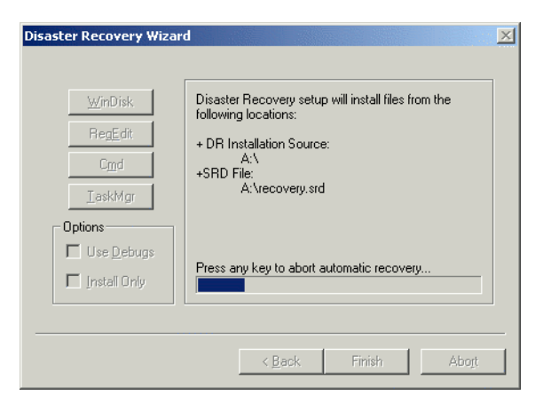
Figure 5-1 Disaster Recovery Wizard

1. When the Disaster Recovery Wizard appears, press any key to stop the wizard during the countdown.