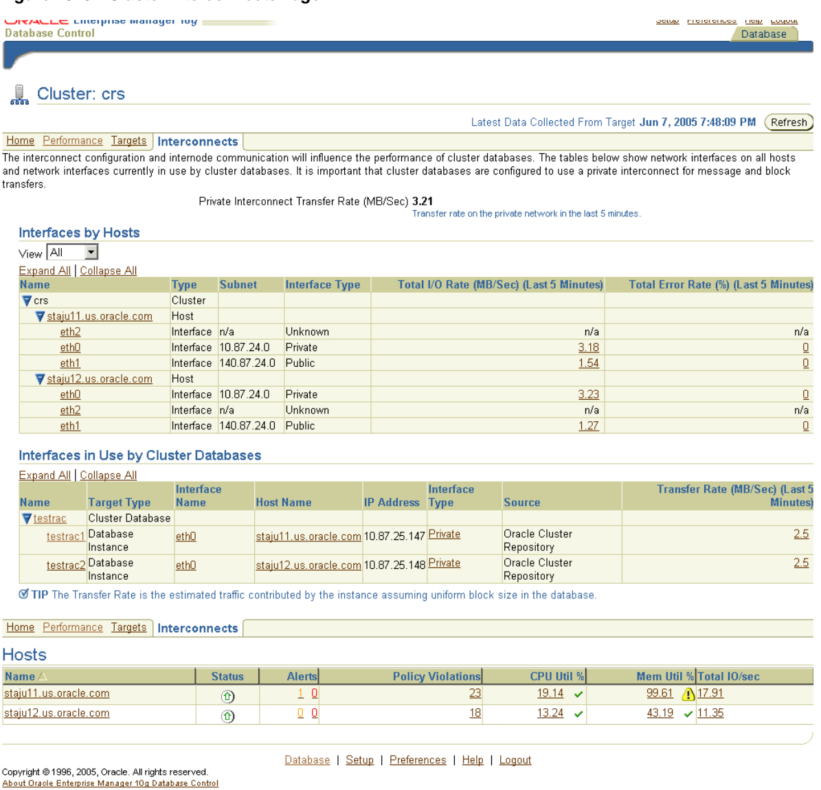
Figure 13–3 Cluster Interconnects Page

The Cluster Interconnects page contains the following summary tables: