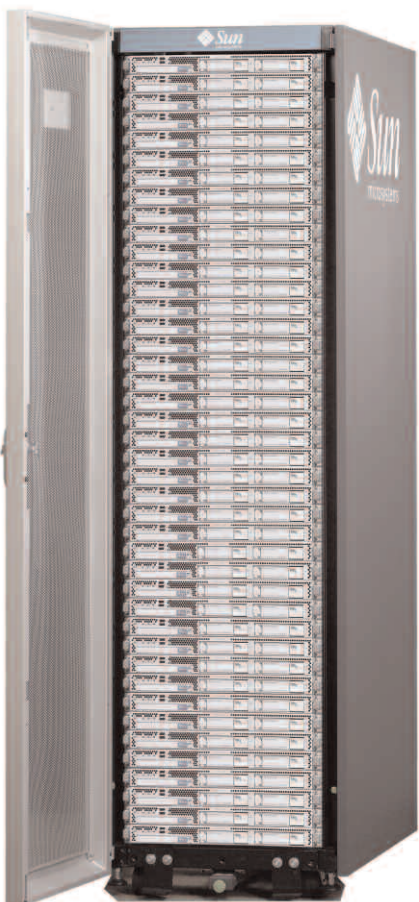
Sun Fire X2100 rack

sun.com/training/catalog/courses/WET-4923.xml