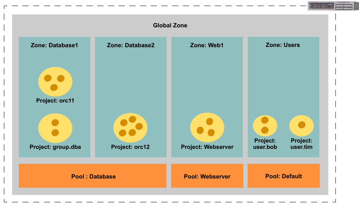
Figure 2. A system with several projects running in Zones that are assigned to resource pools.