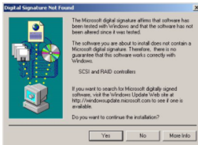
FIGURE 2-1 Windows Hardware Qualification Labs Warning

The Sun StorEdge™ Traffic Manager 4.4 software is not certified by Microsoft Windows Hardware Qualification Labs (WHQL) and that is the reason for the warning message. The dialog box is shown in FIGURE 2-1.