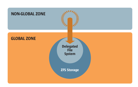
Figure 2—Containers let you isolate ZFS file systems

ZFS and Containers are tightly integrated to allow the zone administrator delegated rights to control the ZFS file systems. By using ZFS and Containers in combination you can assign a portion of the storage pool to a container. This means that the administrator for that container has the authority to manage that portion of the storage pool, but it is isolated from the rest of the system. (See the figure below.) This lets you benefit from both the data integrity of ZFS, as well as the high availability and resource control of containers.