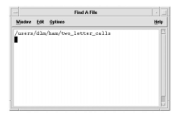
Figure 4-3 Window showing complete path

When you correct the mistake, script_find then executes properly and creates a dtterm window within which it displays the complete path of the file you requested, providing that the file is found.